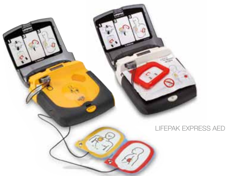
LIFEPAK EXPRESS AED

Ensure the safety of your staff and patients. Only Physio-Control accessories and disposables have been thoroughly tested with LIFEPAK products. Stick with the name you trust and the company that stands behind it. To order, contact your Physio-Control representative or order 24/7 at store.physio-control.com .