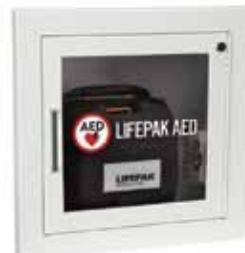
Recessed Mount (1.5" Return)