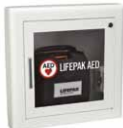
Semi-Recessed (3" Return)